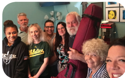
Aged-out foster kids and therapists

Expanding the program, my first visit to a Federal Prison was a great success presenting 3 concerts. The warden came for a concert and made sure I stopped by to thank me before I left. They asked repeatedly if I would come back. But the nicest moment was when one of the men told me that he had heard me at Strafford County last year and was so moved that he wrote me a letter and gave it to the Lieutenant at Strafford for me (unfortunately I never received it). When he heard about this concert, he couldn't believe it was me and waited to see the picture on my flyer. Afterwards, he told me that he felt really lucky to have had the experience of hearing me twice. I suggested that he begin going to concerts when he got out and he said he would.