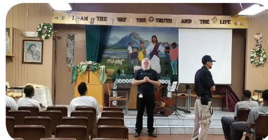
Los Padrinos Juvenile Facility in LA