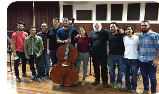
My bass class.

The Festival of Strings brought us back together for a week of coaching, orchestra, lessons and master classes. Over the course of that wonderful week, I coached a group of 9 bassists in an arrangement of Ravel's Pavane for a Dead Princess. It was a strong and moving performance. At the same time, I must have heard 25 or more bass players; young as well as professional. But I especially worked with the 9 from my group, reinforcing the principles that I believe in and that can help them for the rest of their lives.